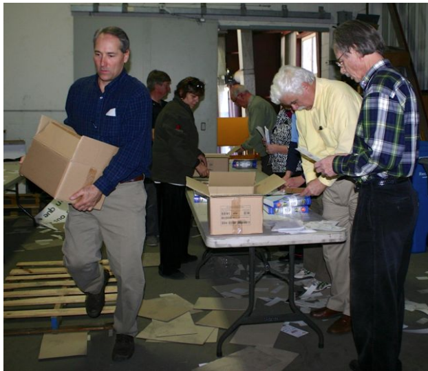
An efficient production line